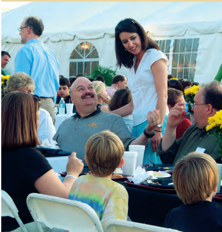
Fish and hushpuppies —More than 350 alumni, faculty, staff, and students are treated to a tasty fish fry on the grounds Saturday night.