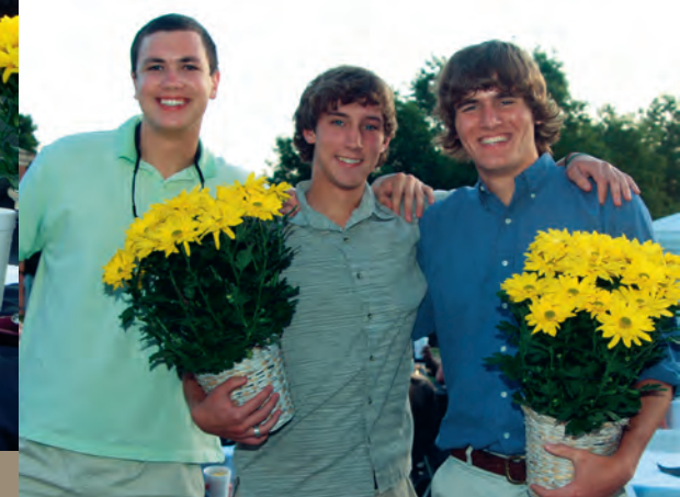
All smiles —Current BSC students join alumni at the dinner on the academic quad.