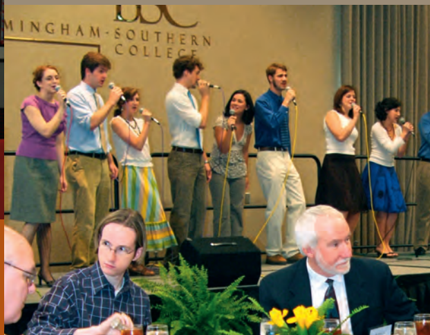
Hilltop performance—Almost 150 alumni enjoy a performance by the Hilltop Singers during the Saturday Alumni Awards Luncheon.