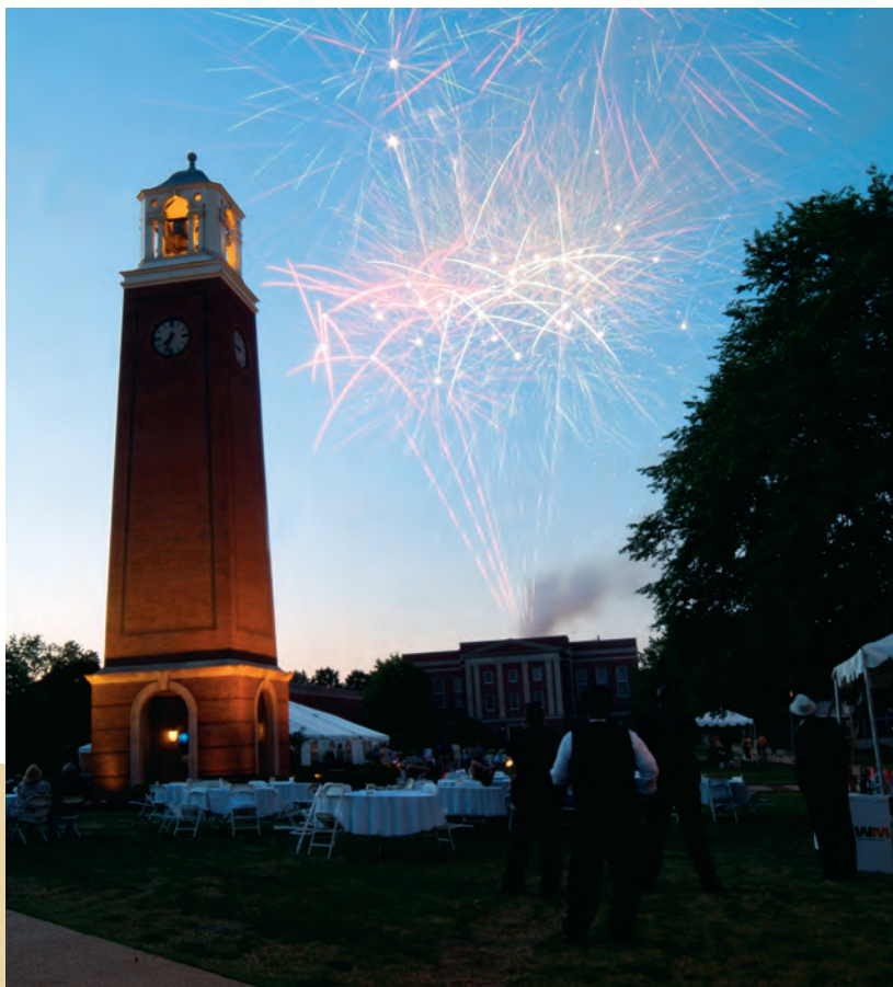
Lighting the skies—Alumni Reunion Weekend 2007 culminates with a grand fireworks extravaganza set to music.

This past spring, more than 650 alumni came back to visit during Alumni Reunion Weekend April 27-28. They celebrated at class parties, receptions, lectures, a family festival, dinner on the quad, and more.