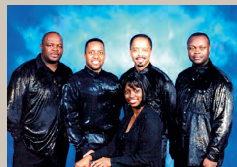
The Connection Band

8:00 p.m.- 11:00 p.m. Band Party: The Connection Band Sponsored by: BSC Student Government Association and Birmingham Beverage Co. Inc. Featuring R&B Motown sounds and classic dance hits.