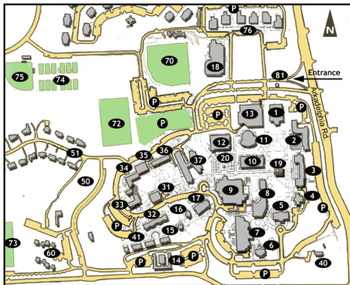
Campus Map Legend