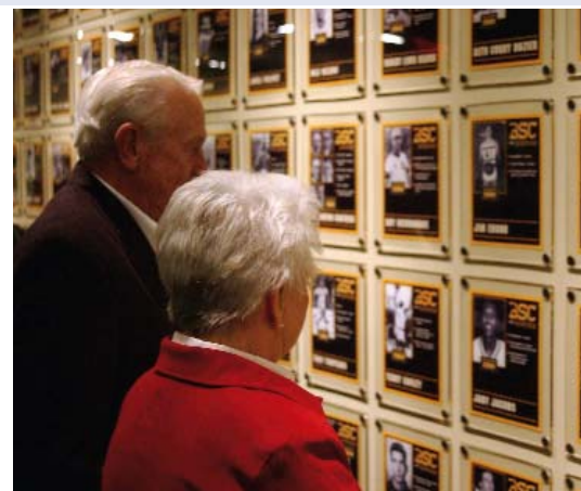
Visitors to the dedication of the T.B. Pearson Sports Hall of Fame Room at Birmingham-Southern look over some of the 135 student-athlete plaques located in the facility.

The $1 million facility was made possible by a generous donation from the T.B. Pearson family and BSC Athletic Foundation funds.