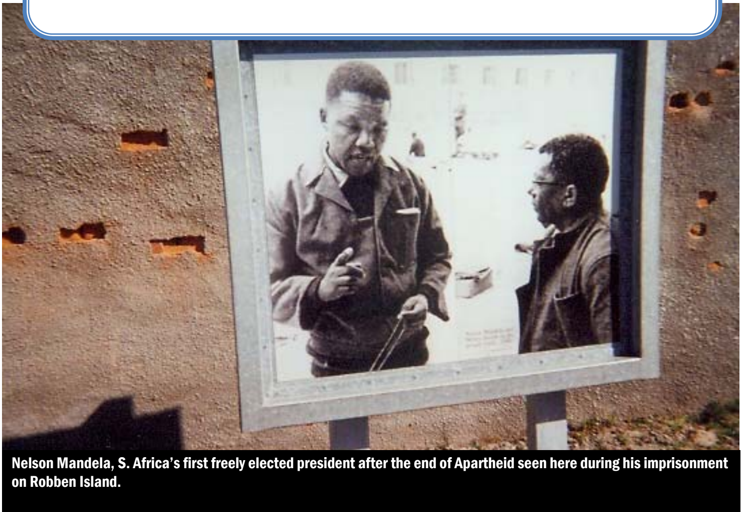
Nelson Mandela, S. Africa's first freely elected president after the end of Apartheid seen here during his imprisonment on Robben Island.